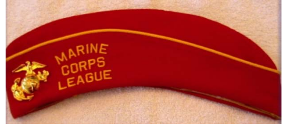
Regular Member – FEMALE