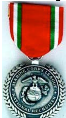
National Recruiting - Silver