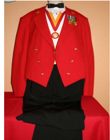
EVENING DRESS JACKET TROUSERS BLACK TUX OR TROUSERS BLACK WITH BLACK DRESS BELT