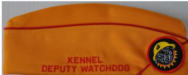
Shown with MODD patch ↑↑