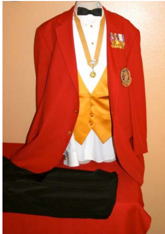
RED BLAZER FORMAL