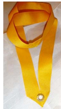
Pedigree Devil Dog