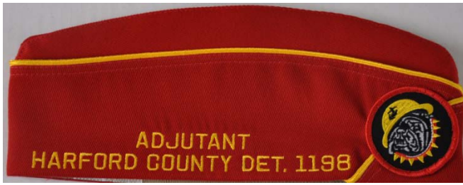
Shown with MODD patch ↑↑