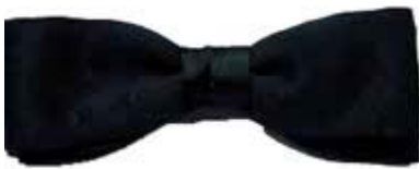
Military Bow Tie