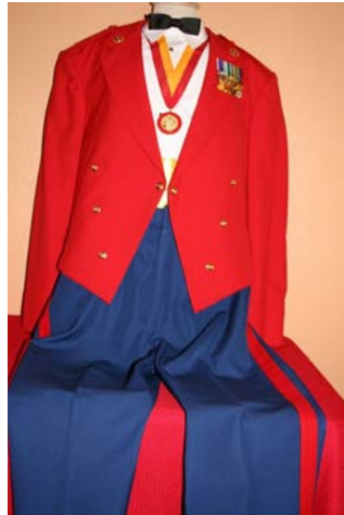
EVENING DRESS JACKET BLUE DRESS TROUSERS WITH RED NCO STRIPE