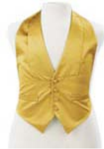
Gold Vest Front