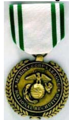
National Recruiting - Bronze