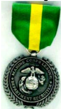
Dept Recruiting - Silver