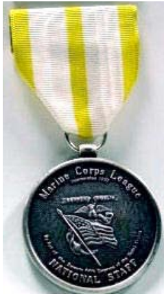
Nat. Staff Elected