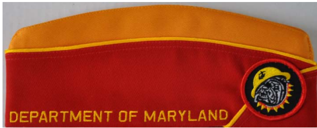
Shown with MODD patch ↑↑

↑↑ Standard Cover worn by ALL members of the MCL ↑↑