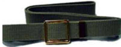
Web Belt with Buckle