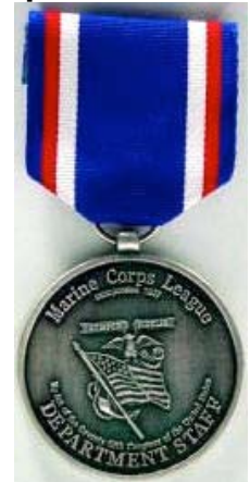
Dept Staff Elected