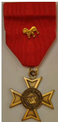
Pack Dog of the Year