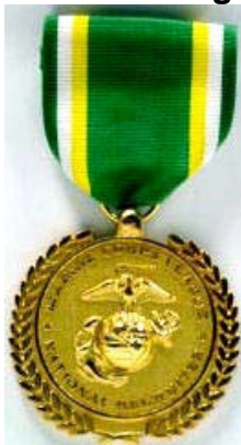
National Recruiting - Gold