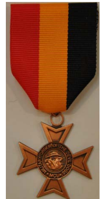
Past Pound Keeper