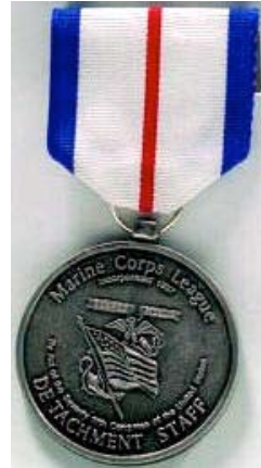
Det Staff Elected