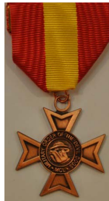
Past Pack Leader