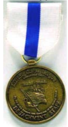
Det Staff Appointed